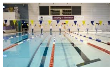
Top: Inverness Leisure Competition Pool and Spectator Area. Above left: FINA Approved track start diving blocks. Above right: View of Competition Pool and electronic board.

The North District Masters Committee also invites you to attend the Ceilidh and Awards Evening after a successful day's competition at the Chieftain Hotel where we will celebrate the day's swimming into the wee hours.